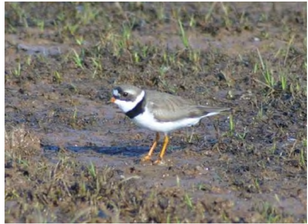
C. Bickham Dickson Park April 30, 2001 They are rare in this area.