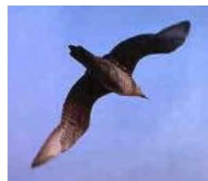
Cross Lake, Sept. 13th, 2000 Shreveport, Louisiana